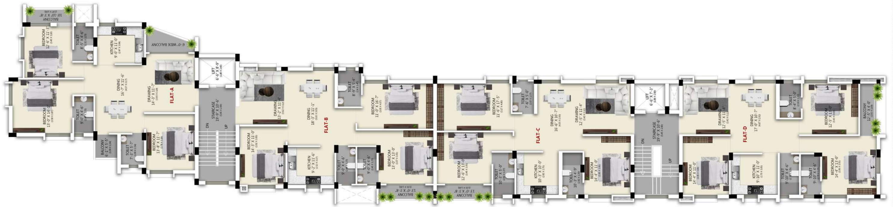
TYPICAL -1ST TO 3RD FLOOR PLAN