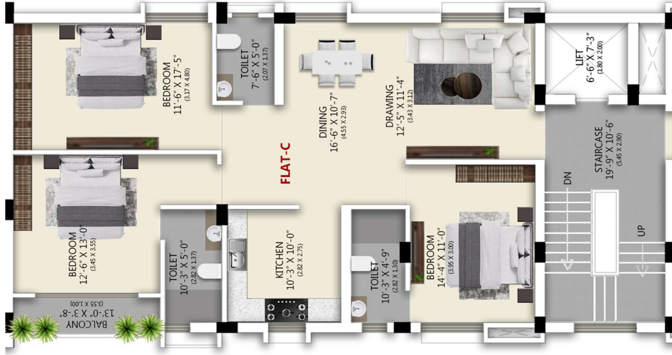
TYPICAL FLOOR PLAN (1C/2C/3C/4C)