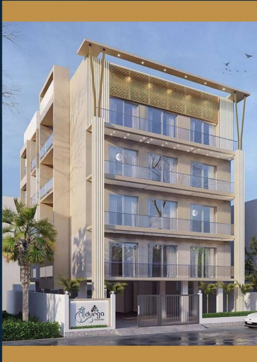
SHREE DURGA HOMES