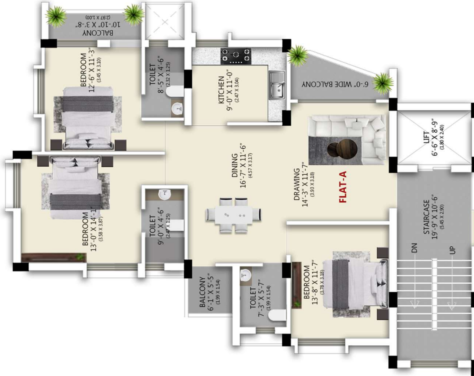
TYPICAL FLOOR PLAN (1A/2A/3A)