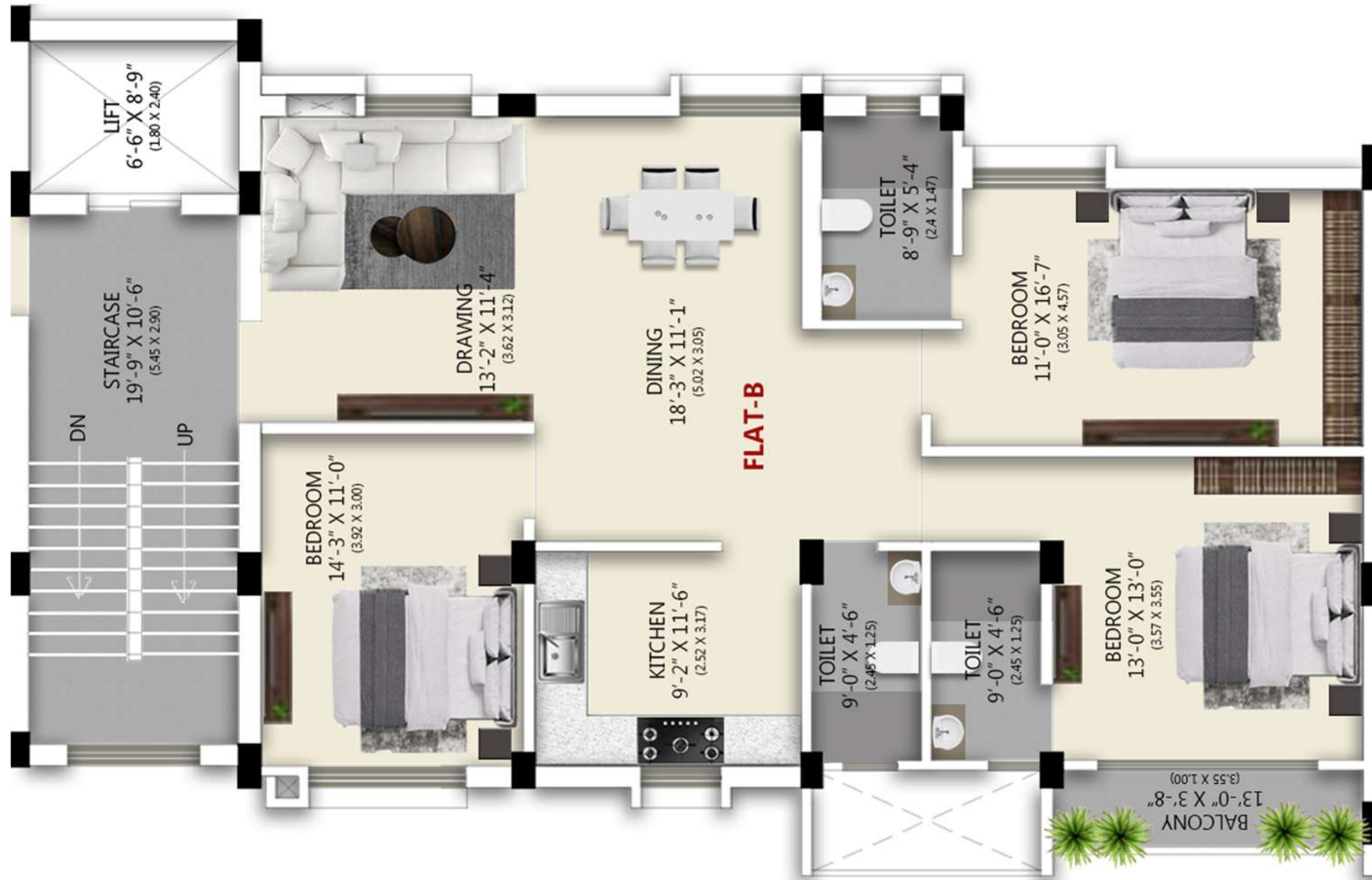
TYPICAL FLOOR PLAN (1B/2B/3B/4B)