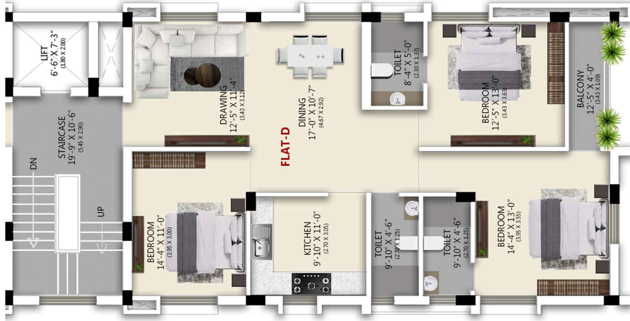
TYPICAL FLOOR PLAN (1D/2D/3D/4D)