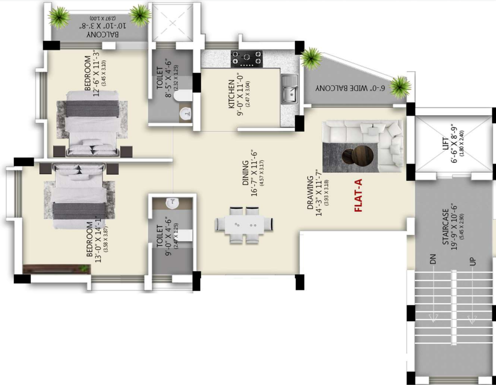
FLOOR PLAN (4A)