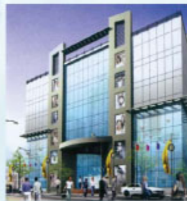
NATURAL PLAZA, Sambalpur