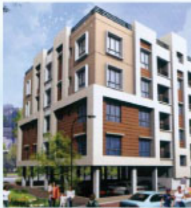
NATURAL COMFORT, Rourkela