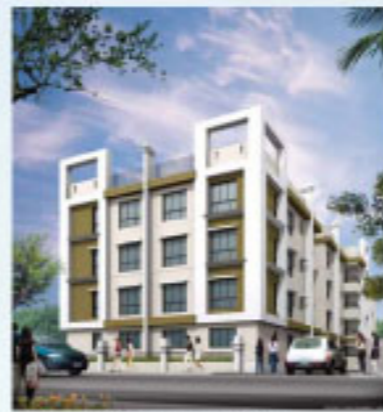
SAHEJ ENCLAVE, Rourkela

The story began years ago, when Real Tech Group was established with a dream of providing people with new kind of living experience, the likes of which no one had ever thought before. With longstanding emphasis on commitment, quality and innovation, the group succeeded to maintain years of relationship with people by understanding their dreams and making those dreams come true. The next stop in this path is the opening of Sahej Garden, where every home awaits to create a unique living experience the whole family can enjoy.