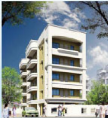
SAHEJ VILLA, Rourkela